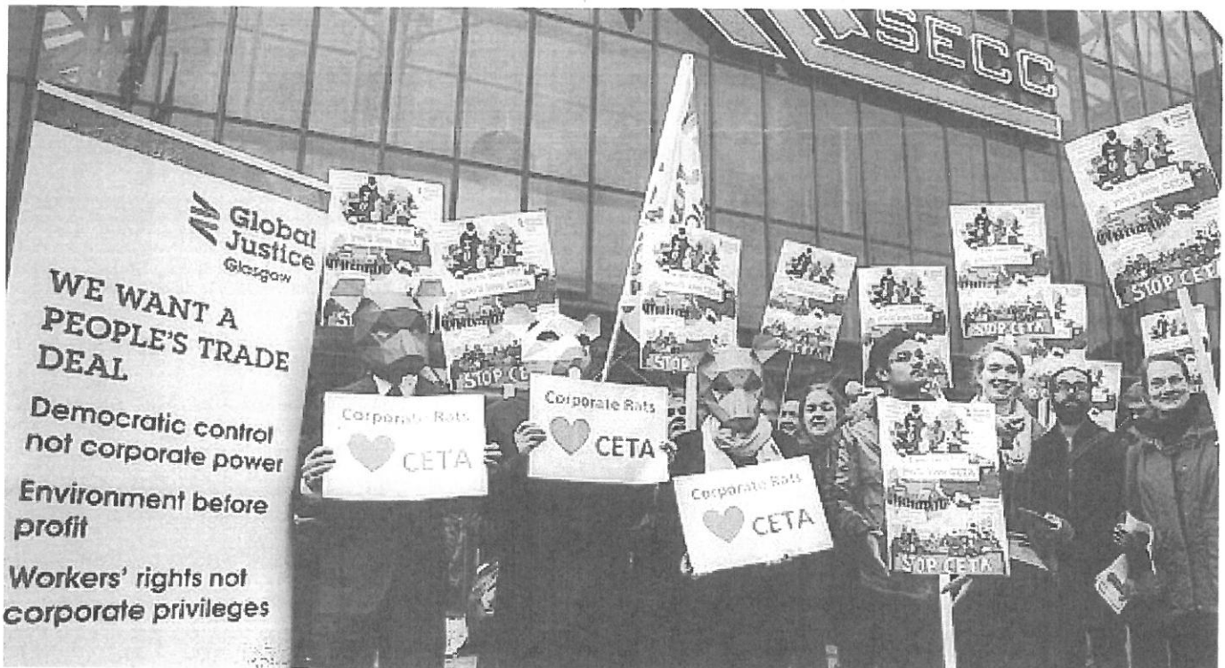
Members of the coalition protest against CETA at the SNP conference in Glasgow

10. Foreign aid should be kept as a separate issue from trade, so that it cannot be used to persuade a country to open up its domestic markets.