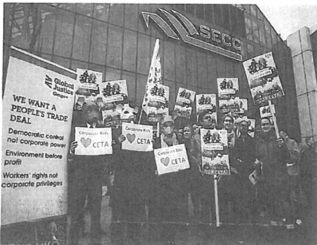
Global Justice Glasgow protest against CETA at the SNP conference in Glasgow

1. Trade policy and trade negotiations should begin with meaningful public consultation. The UK parliament should be able to scrutinise, amend or terminate trade negotiations.